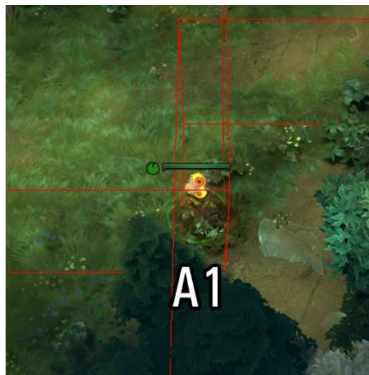
The Magic Bush

These are seven of the most frequently placed wards used to block the Radiant pull camp. Each ward is useful in different situations. The red box represents the spawn site.